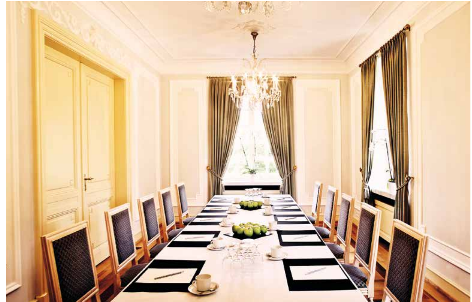
THE BEETHOVEN HALL