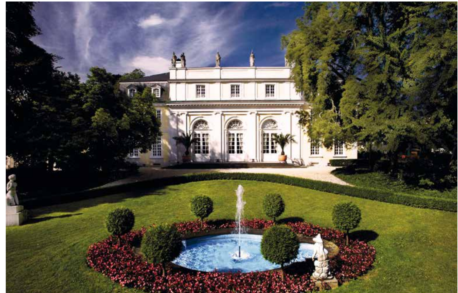
THE GARDEN VIEW